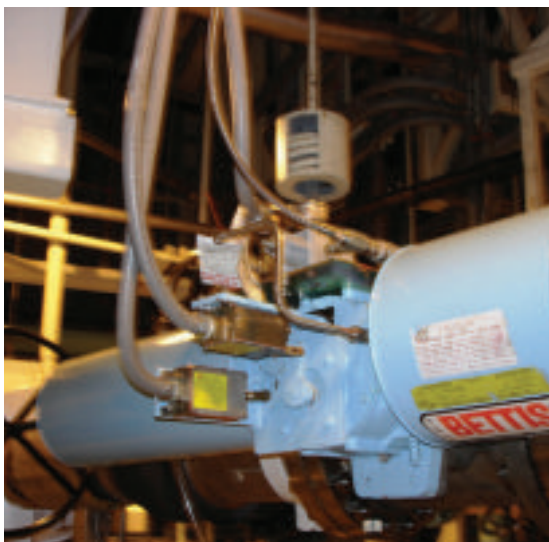
Pneumatic rotary actuators installed in a nuclear power plant.

The nuclear industry is growing at a fast and exciting pace for automated actuator and valve applications. The actuator manufacturers that are willing to meet these challenges head on with solutions will be the successful leaders in the nuclear industry.