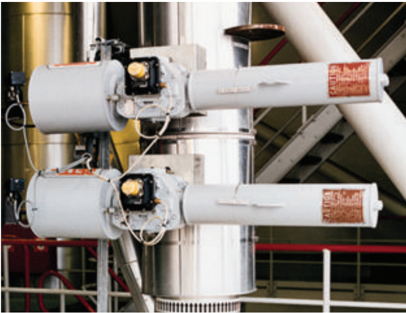
Redundant stem line pneumatic actuators.

arm length is the distance between the center of the yoke bore and the center of the connecting point of the yoke to the piston rod. This torque is compared to the required valve torque to travel in both directions with the applied differential pressure on the disc, plug, or ball and the applied safety factor. The safety factor will ensure that the actuator has the required torque to operate the valve after any loss of efficiencies to the valve and/or actuator.