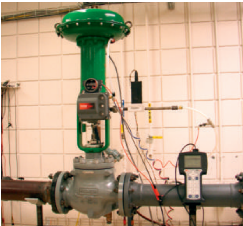
A linear pneumatic actuator.

Double acting actuators have a pneumatic cylinder and housing. They require pneumatic power to operate the actuator in both clockwise and counterclockwise directions. Spring return (or single acting) actuators have a pneumatic cylinder, housing, and spring. They require pneumatic power to operate the actuator in one direction, and on loss of the pneumatic power the spring will rotate the actuator in the opposite direction. The size of the piston or cylinder and the pneumatic supply pressure will produce a specified amount of force. The force is transferred through a piston rod to the scotch yoke mechanism. This force is then multiplied by the moment arm length of the yoke to calculate the torque output of the actuator. The moment