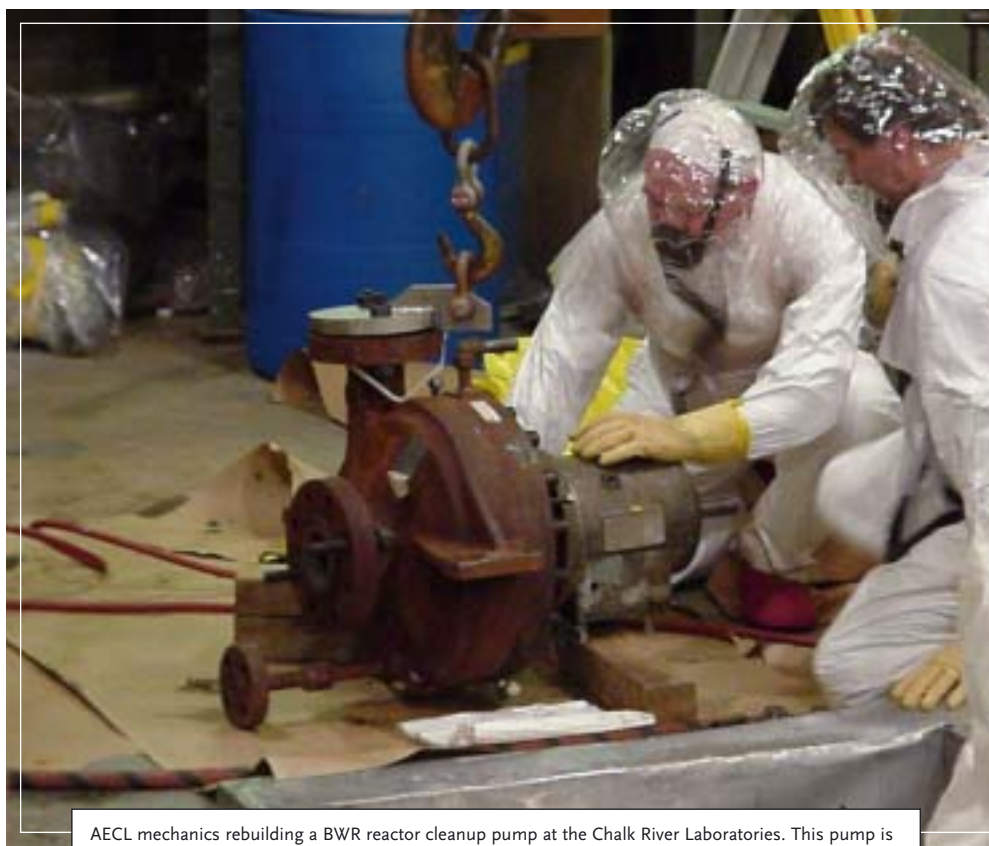
AECL mechanics rebuilding a BWR reactor cleanup pump at the Chalk River Laboratories. This pump is highly radioactive and must be handled with care. Without reliable operation of this pump, the reactor cooling system chemistry would slowly deviate from specification forcing a plant shutdown.